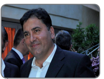
Guido Cappellini, ten-time World Title holder, F1 Powerboat Inshore