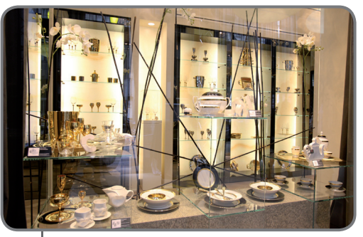
A taste of Zepter, the interior of Zepter Lifestyle - Milano